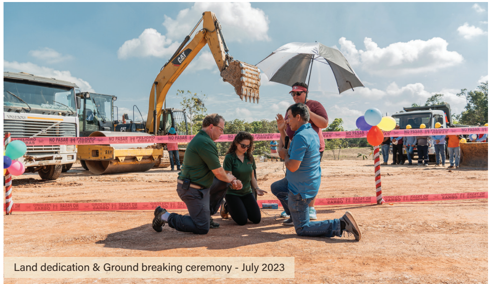
Land dedication & Ground breaking ceremony - July 2023

From 2004 - 2019, we were a small family ministry taking a few mission teams to do surgery each year. Over 20 years, little-by-little we have nurtured friendships with faithful donors, deepened our relationships with other organizations in Peru, cultivated mentors from mission communities in Pucallpa, partnered with local churches in the Ucayali Region, little-by-little. Look what's happened in just five years—yes,