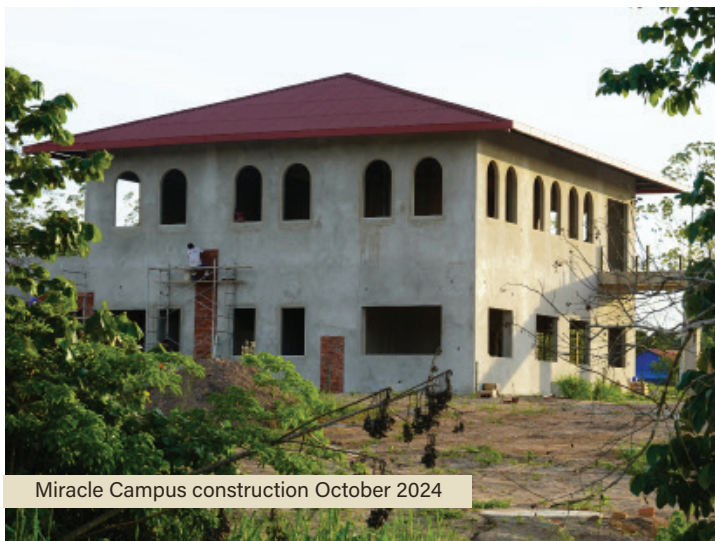
Miracle Campus construction October 2024