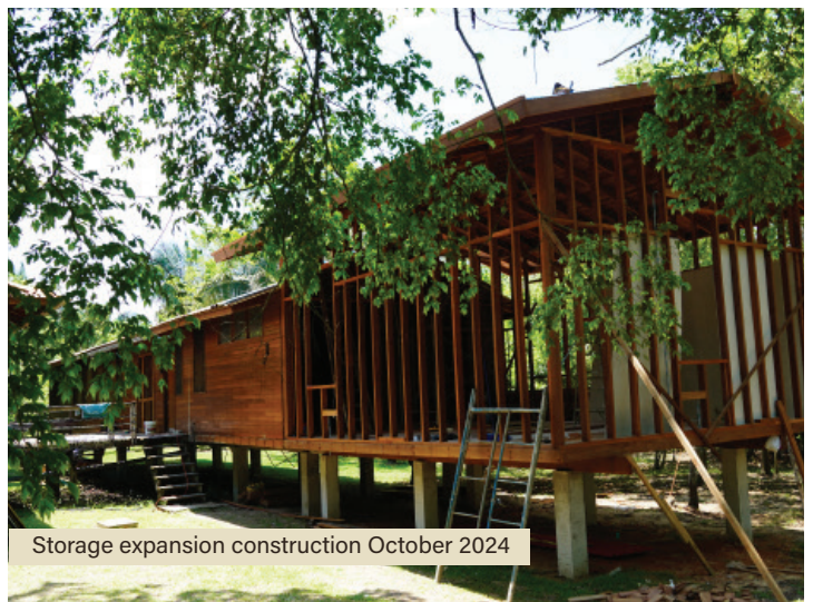
Storage expansion construction October 2024