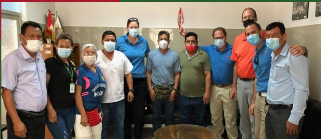
Scalpel At The Cross staff and leadership with partners and leaders at Hospital Amazonico in Pucallpa, Peru