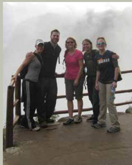
Team members after climbing Machu Picchu at 4am in the morning.

Though my first thought is to launch into a Biographical Epoch on The Force of LK Schroder , I will simply try to capture two great memories from the beginning.